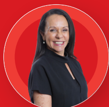
The Hon. Linda Burney NSW Award Winner